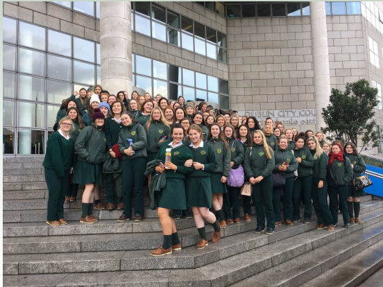
6th Year Students before watching Macbeth at Smock Alley Theatre.