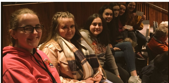
5th Year students attending the Opera during this year's Festival.