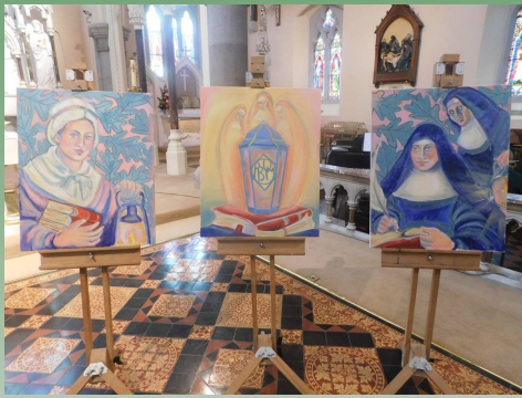
Wonderful art work portraying the founding sisters during Bicentenary Week. We look forward to the unveiling of our sculpture in the New Year.