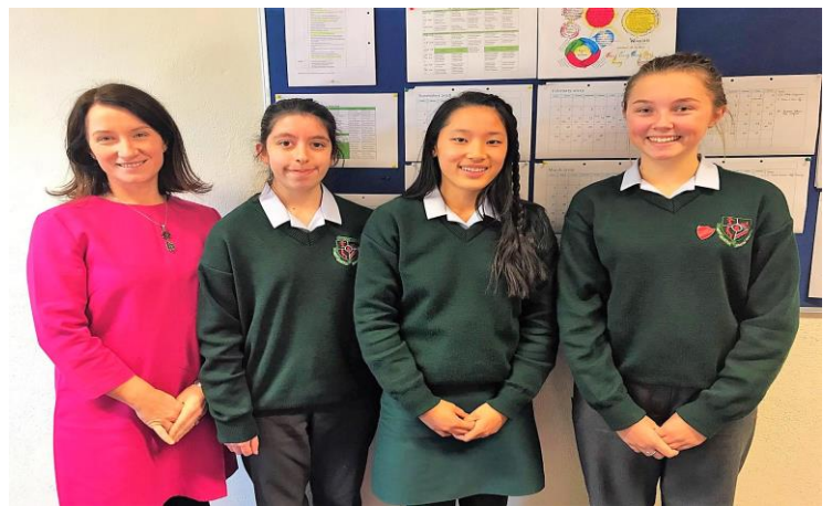
First Year Pupils participating in a debate with Presentation Boys