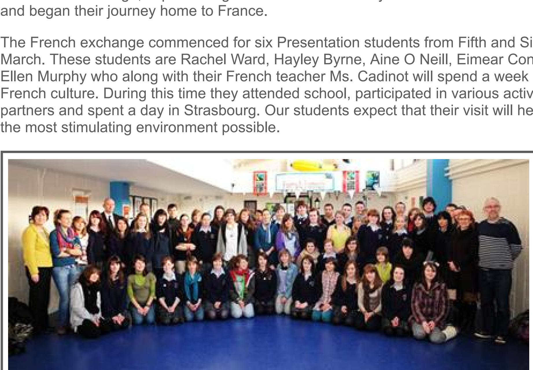
Pictured above are the French exchange group in Presentation College