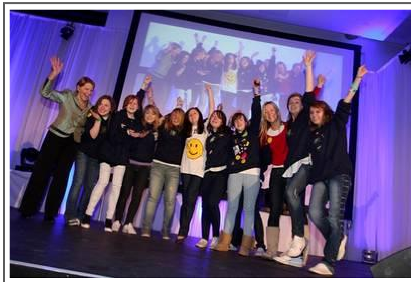
St. Mary's Secondary School New Ross (pictured below) who won the Bronze Award for their project "It's

Mercy Mounthawk, Tralee, (pictured below) who won the Silver Award with their project "Emotion Promotion".