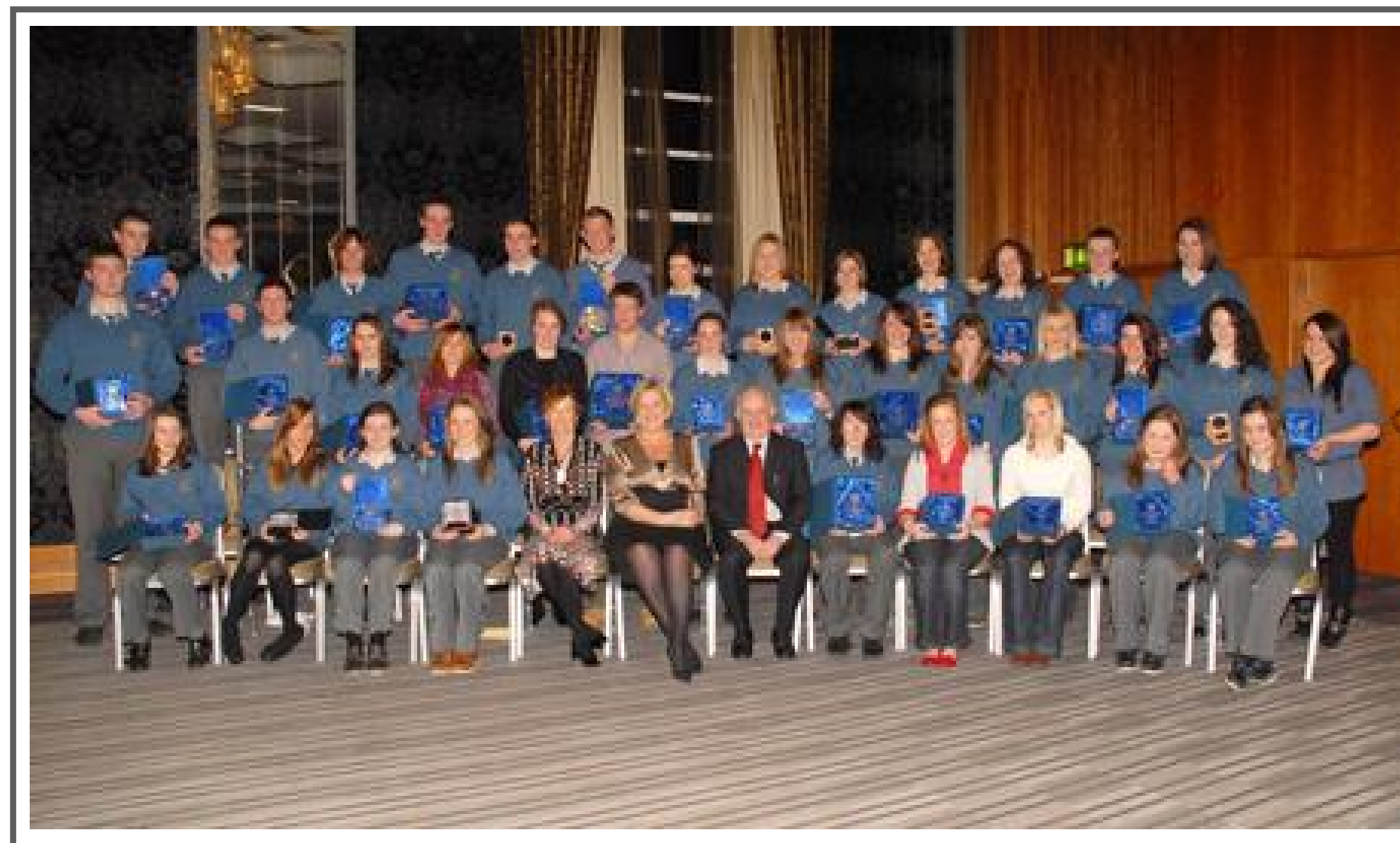
Pictured above the full group of award winners pictured with special guest