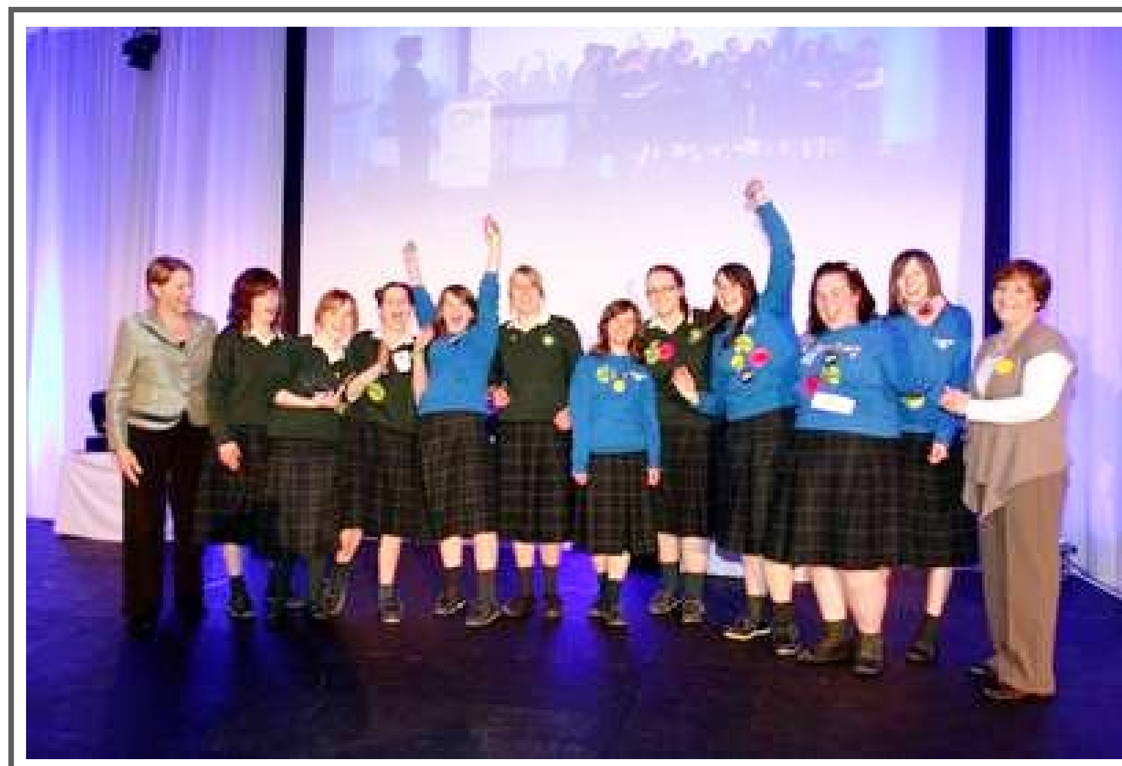
Mercy College Model Farm Road, Cork, who won the award for " Making our Community Better "

with their project, "Sex Trafficking – It Is Happening";