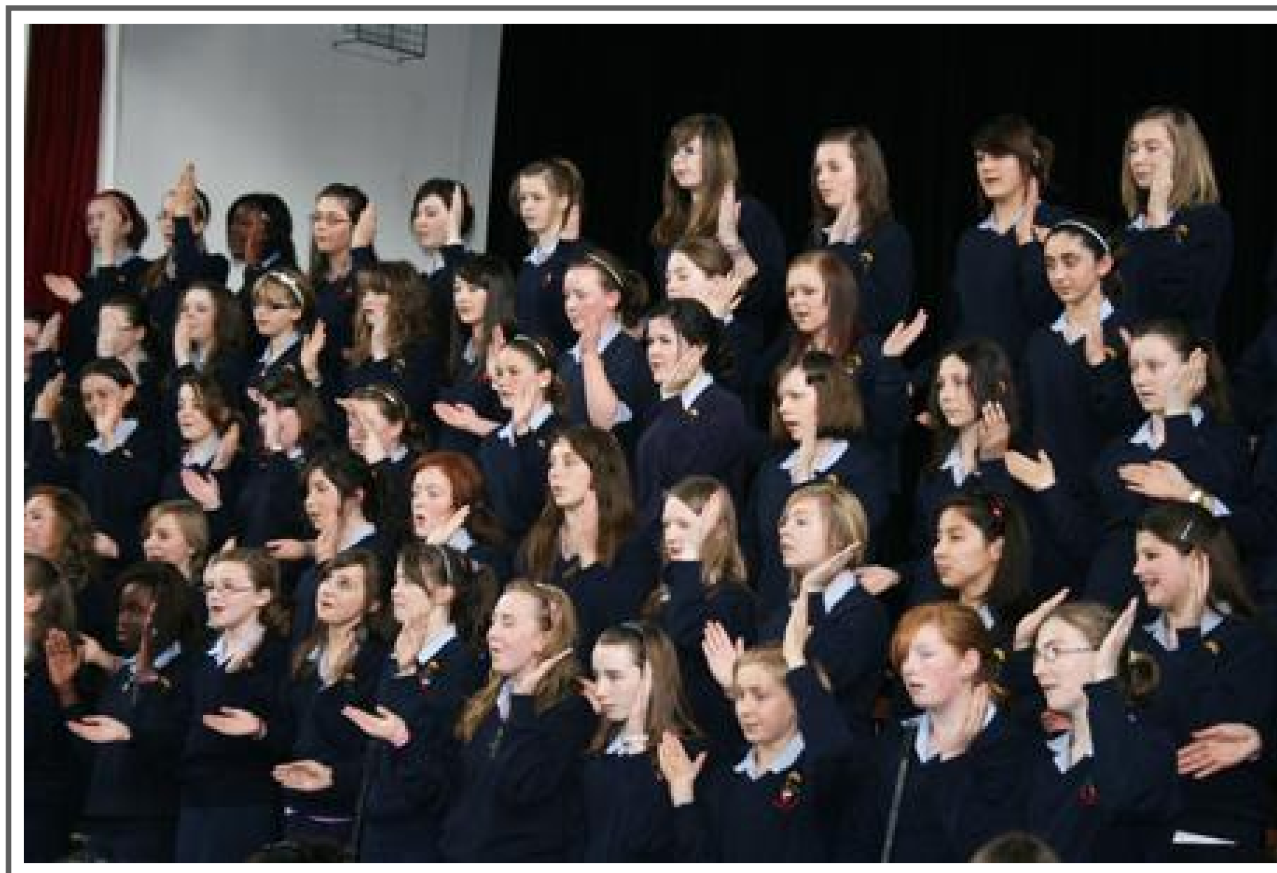
Pictured above are the first year choir performing a medley of pop songs at