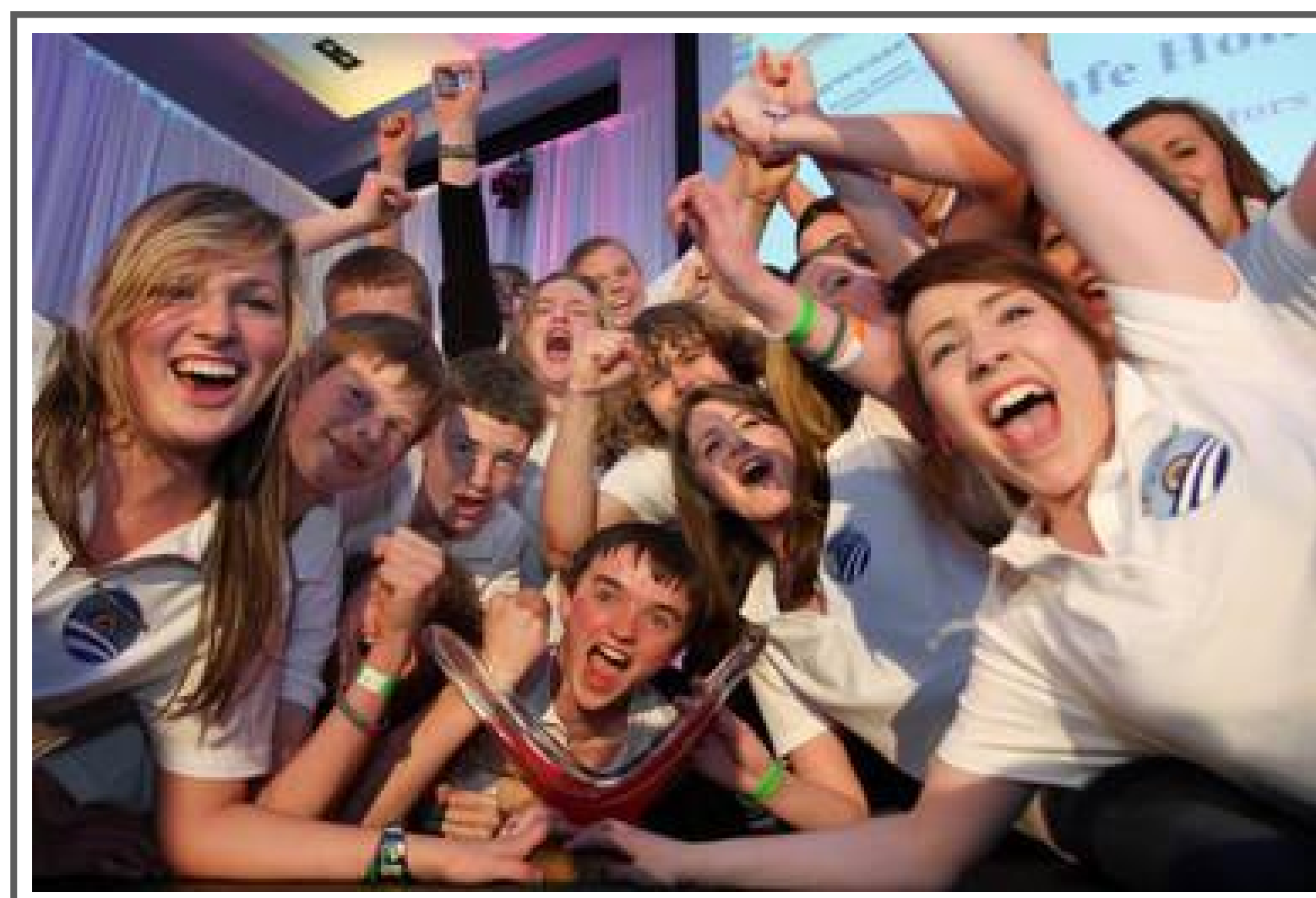
Pictured above students from Scoil Mhuire Gan Smál, Blarney, Co. Cork celebrate after being named Young Social Innovators of 2010 for their

It is wonderful to see so many of our CEIST schools being involved in such projects. Sincere thanks and congratulations to the teachers without whose dedication and commitment such enterprising initiatives could not be undertaken, nor excellence achieved. Involvement in projects which identify and highlight issues of justice are a tremendous example of the ways in which the CEIST Charter is being lived in our schools every day.