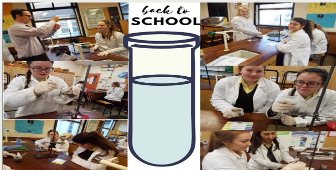
The Science Department

Other aspects of our work in the English Department are dealt with in our annual report which will be available on the school website in September.