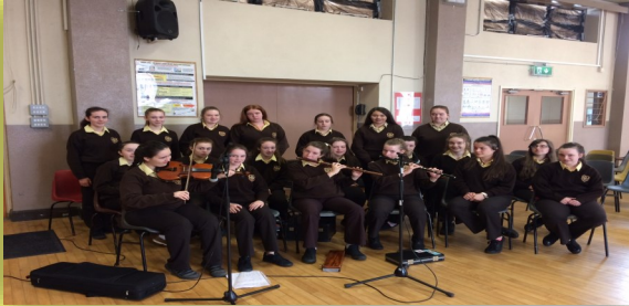
Award's Day 16th May

Music week was invaluable to the 3 rd and 6 th years, as they got a chance to perform before their practicals, which took place after Easter.