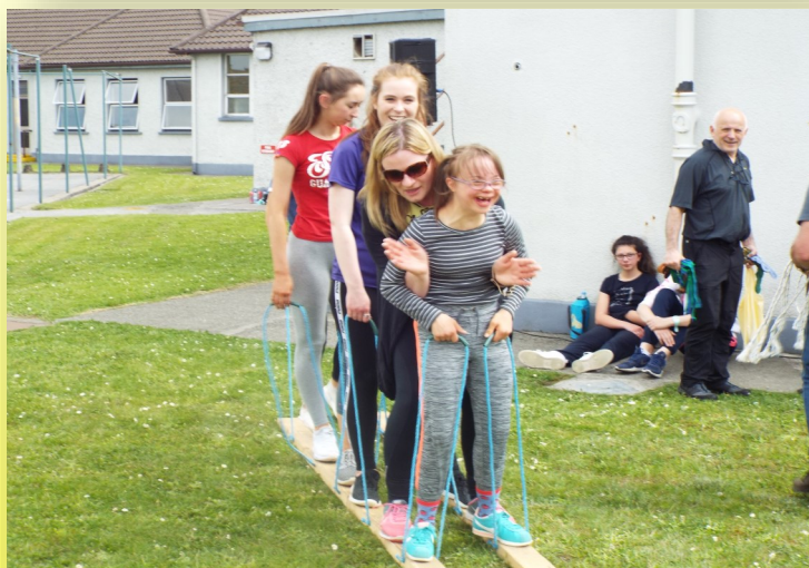
The 5th Year Biology trip to Killarney National Park