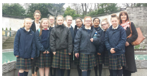
First Years attend An Post awards ceremony

Transition years visited UCD recently to tour the college and will be visiting Trinity College Dublin and Dublin City University over the next number of weeks. Best wishes from the guidance department to all our examination class students completing oral examinations and submitting examination project work. Remember you can follow the guidance department on twitter @TheRockGuidance.