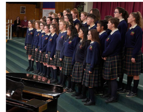
Rockford Manor Choir compete in Wesley College