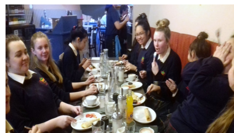
Cafe du Journal