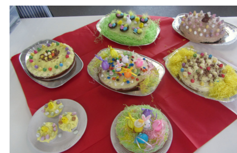
Cake competition entries