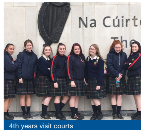
4th years visit courts