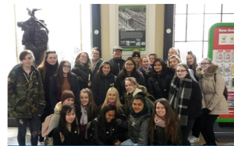
Visit to the GPO

A fascinating day was had by Rockford's senior history students in Dublin city on Thursday 2nd March. We started off in the Little Museum of Dublin on St. Stephen's Green. There we got a potted social history of Dublin. After that we were whisked around on a 1916 Rising walking tour. Our guide certainly informed, entertained and shocked - leaving us plenty of room for debate afterwards. After lunch, we met in Dublin Castle for a tour of the buildings and their functions. In its grounds we got to see the original pool (now under a round green) that the native Irish used to name our city- Dubhlinn (black pool). We took a look at the curious artifacts in the Chester Beatty Museum nearby before calling it a day.