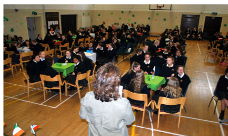
Trath na gCeist