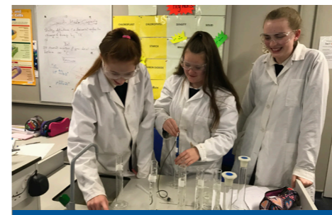
3rd Year Science Investigations