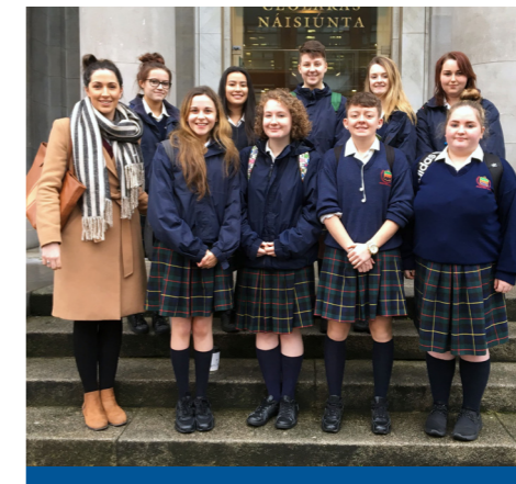
6th Year Music students visit NCH

I'm said to be the painter of the night sky, The one who colours in the wind. I've been told I sit atop the crescent moon And chuck my paint before the night sky. To be true, I don't sit atop the moon. I drift alongside the stars And I doze upon gossamer clouds. I don't simply "Chuck" my precious dyes on my canvas called the sky. I heedfully bleach and tinge and tint my cherished humble sky. My craft is very tedious; it can sometimes take me over half a day. But, that's just my job. That's just me. I paint a lot. 'Cause I Am The Man Who Paints The Sky.