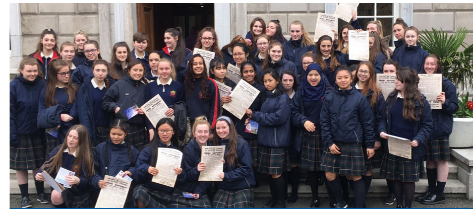
3rd Years visit the Dail

"A Christian environment where teaching and learning nurture the personal development of every student"